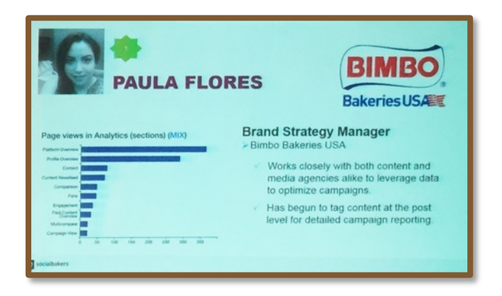
2017 GBF No 1 SM effort WW (Social Bakers)