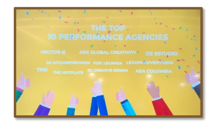
2018 GBF Top 10 MH Agencies (GB)